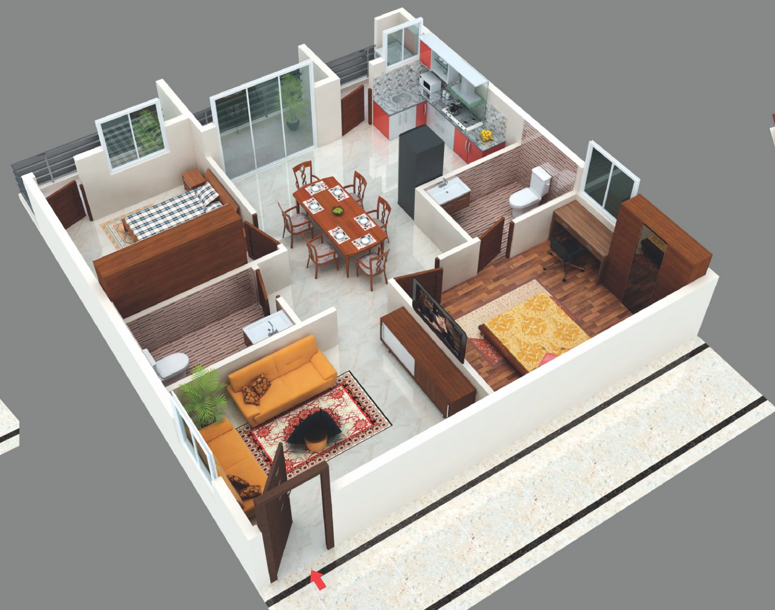
2 BHK | FLAT NO : A-103 ISOMETRIC VIEW