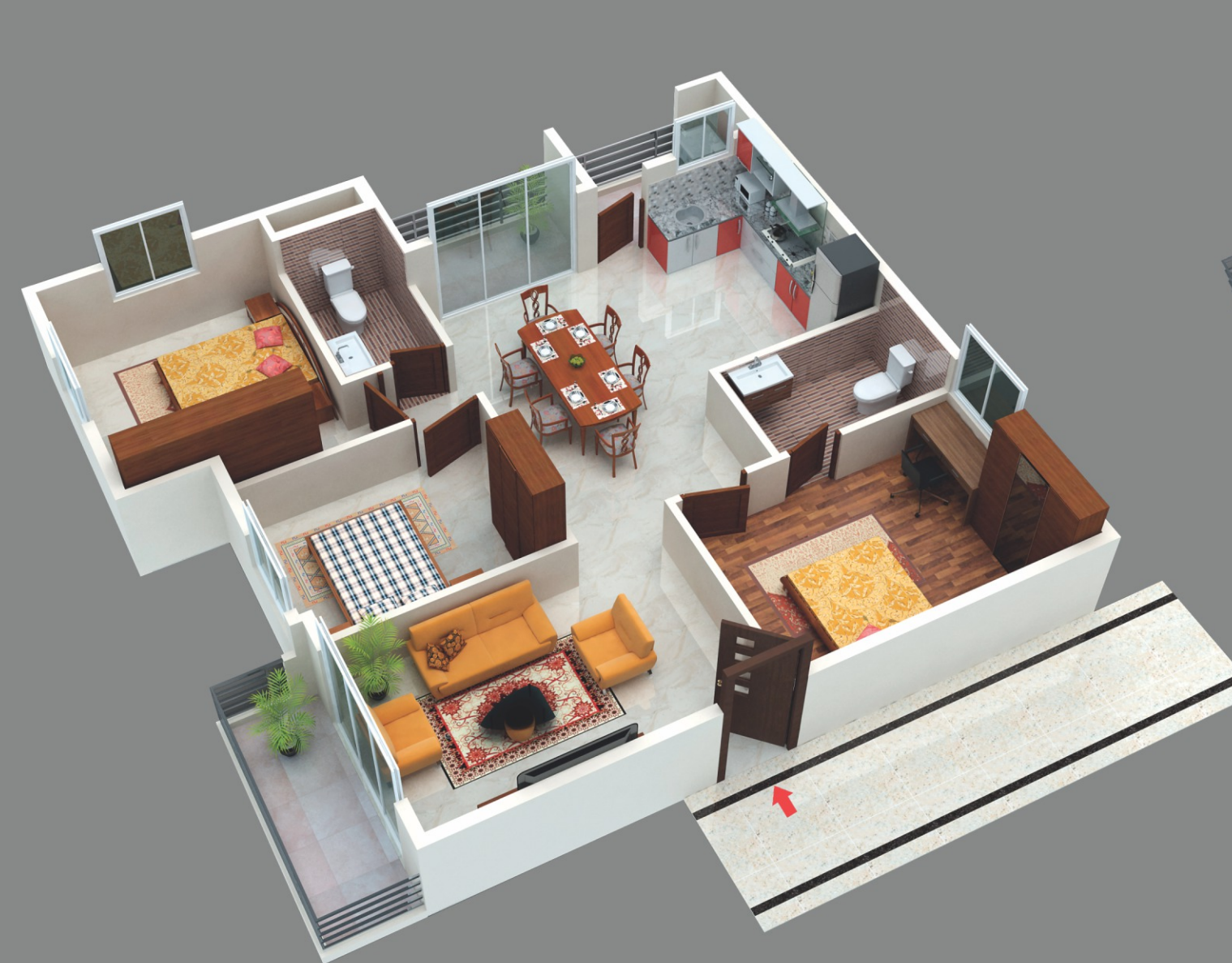
3 BHK | FLAT NO : A-101 ISOMETRIC VIEW